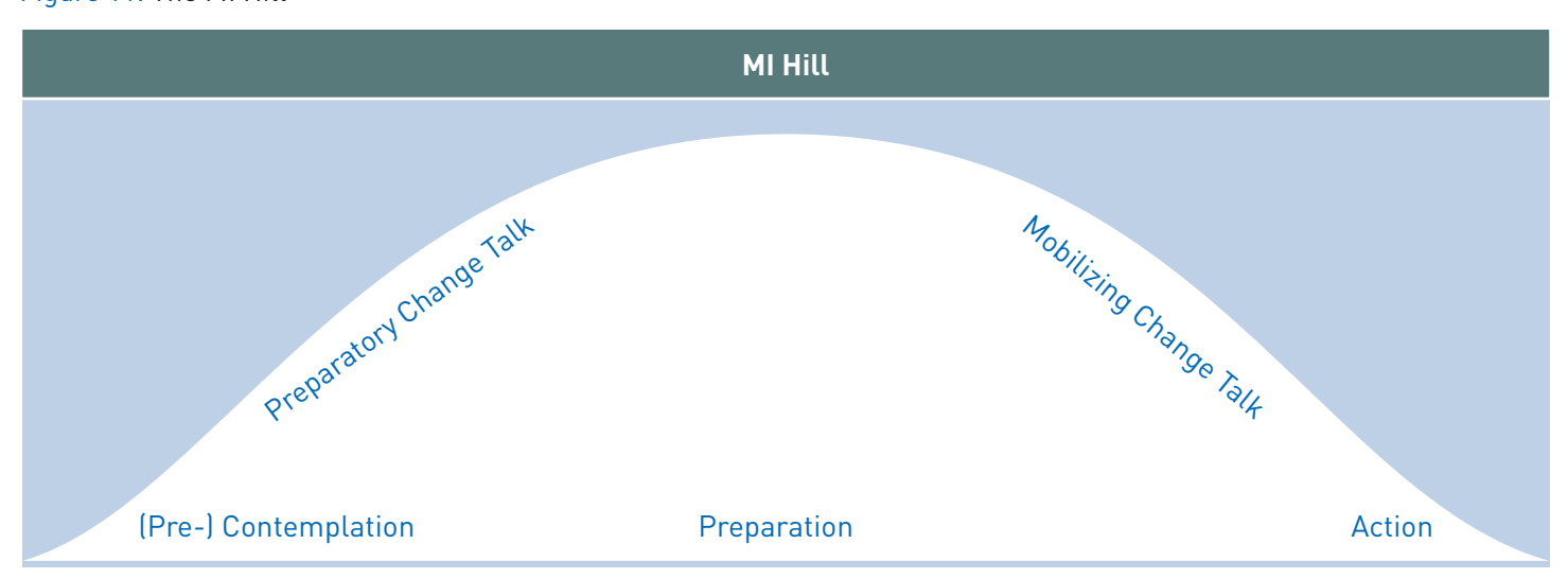
Figure 11. The MI Hill

In the last decade of rigorous research, it has become very clear that a practitioner's approach can influence the way a patient responds to a discussion about behavior change. As summarized earlier, when a practitioner uses an MI consistent approach, i.e., affirming, supporting, asking for permission before sharing information, and when a patient receives non-judgmental unconditional positive regard from the practitioner for where he or she is in the change process, he or she feels accepted and is more ready to discuss change. As a result, the patient is more likely to discuss possible benefits for the change, or Change Talk. This includes what is called Preparatory Change Talk, i.e., their desire, ability, reasons and need for change, along with what is called Mobilizing Change Talk, i.e., their commitment towards the change, activation towards change and steps that they are already taking. This represents the Best-Case Scenario in health coaching. Therefore, after the patient is engaged, it is critical that special attention be focused on evoking and strengthening change talk as shown in Figure 11.<sup>27</sup>