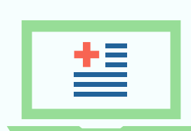
ELECTRONIC HEALTH RECORDS

Growing numbers of practice teams are adopting population health management tools and strategies: