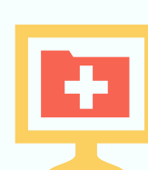
HEALTH INFORMATION EXCHANGE