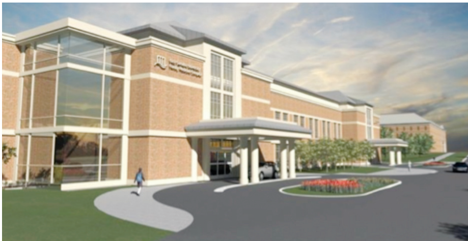
Rendering of New Family Medicine Center—slated to open in early 2011

The Brody School of Medicine at East Carolina University was created with primary care as its core mission. Located in Greenville, North Carolina, the Brody School of Medicine was established in 1977 in part as an effort to increase the supply of primary care physicians in the state and improve the health status of eastern North Carolinians – an area comprised of 29 counties that experience a considerable shortage of health