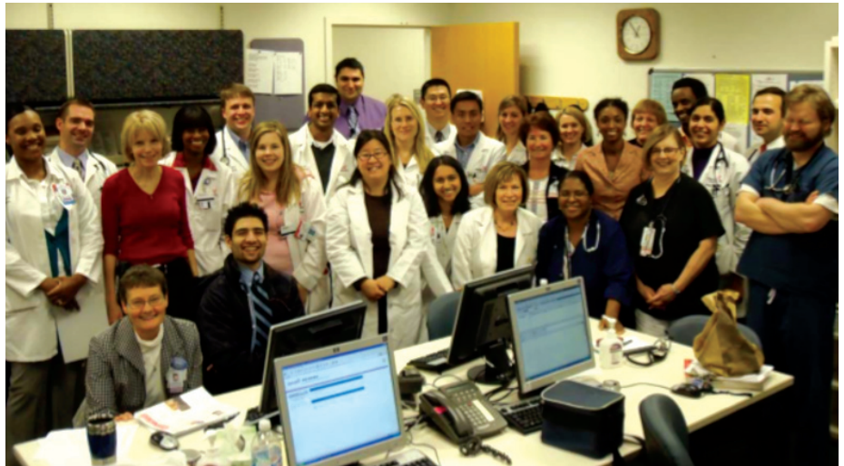
The Long Block 4 Team at their weekly meeting

At 12:15 PM each Monday afternoon, members of the University of Cincinnati (UC) internal medicine team meet in the preceptor room. Represented at these meetings are the full spectrum of care providers, staff, and administrators associated with the UC Hoxworth Ambulatory Center, the primary internal medicine residency clinic. The meeting agenda may vary slightly by week, but the focus always remains the same: improving patient care. Meetings always begin with a patient story – an opportunity for the team to share an interesting or difficult learning experience associated with a particular patient encounter. Care processes are walked-through, tips are shared, and the team as a whole gains from the discussion. Quality improvement education is rooted throughout the meeting. If the providers and staff who make up the Hoxworth Ambulatory Center act as the clinical quality engine, data serves as the fuel.