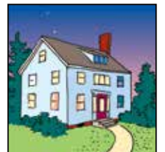
. . . or home