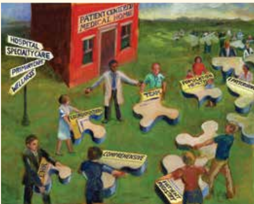
CASE MANAGEMENT • CHRONIC CARE • COMPARATIVE EFFECTIVENESS • DISEASE MANAGEMENT

ENGAGED CONSUMERS • EVIDENCE-BASED • BEHAVIORAL HEALTH