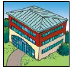
At your office . . .

PROS: Live digital feed and 24/7 Internet access for the next six months; accessible in the office, at home or anywhere worldwide with Internet access; avoid travel expense and hassle; no time away from the office.