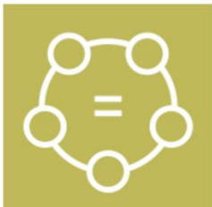
COMPREHENSIVE & EQUITABLE