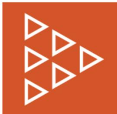
TEAM BASED & COLLABORATIVE