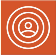
PERSON & FAMILY CENTERED