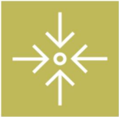
COORDINATED & INTEGRATED