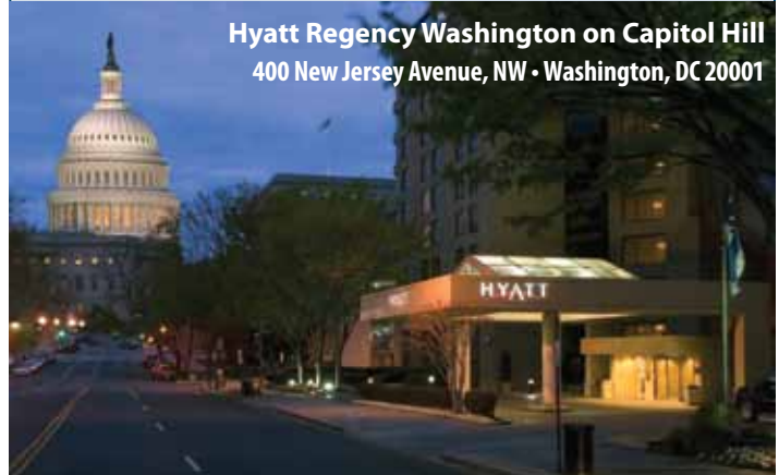
Hyatt Regency Washington on Capitol Hill 400 New Jersey Avenue, NW • Washington, DC 20001

Reservations at the group rate will be accepted while rooms are available or until the cut-off date of Tuesday, September 30, 2014 . After this, reservations will be accepted on a space-available basis at the prevailing rate.