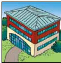
At your office . . .