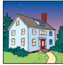
. . . or home

Watch the conference in live streaming video over the Internet and at your convenience at any time 24/7 for six months following the event.